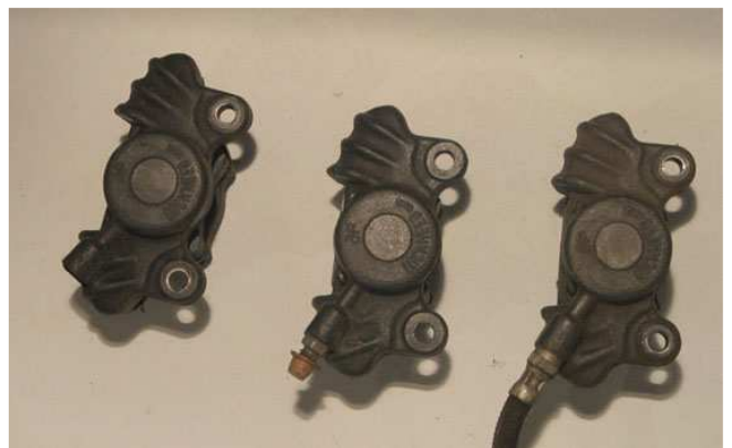
Classic racer calipers: Lockheed CP2195 ..... $100 each (not used since 1974)