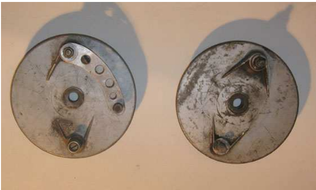
Parts shown: Rear brake plate with brake shoes ..... $25 each