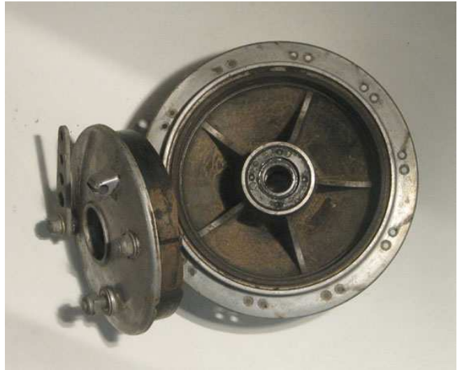
Parts shown: Front hub with brakes ..... $75